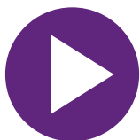
Play Video Opens in browser