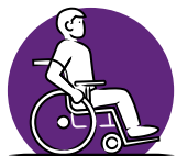
Wheelchair Access with assistance

There is 1 Blue Badge/1 Parent/Child parking bay within the car park.