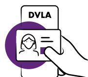
Both parts of licence