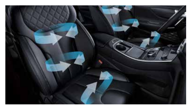
Ventilated front seats. Only available on Ultimate Trim.