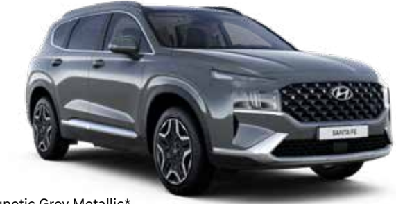
Magnetic Grey Metallic*