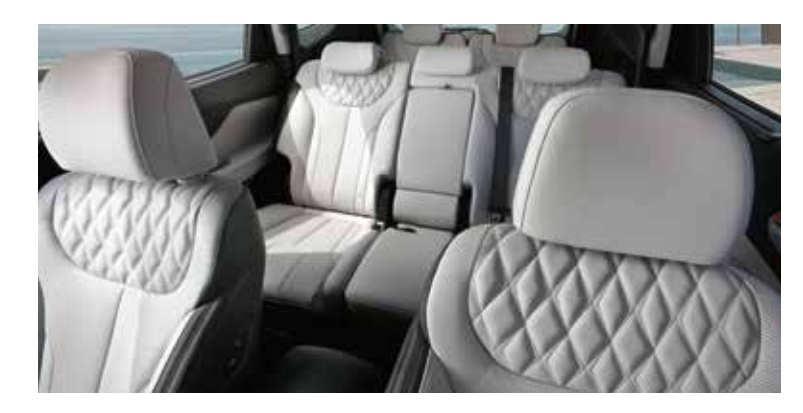
Quilted Nappa leather seat available on Ultimate trim with Luxury Pack.