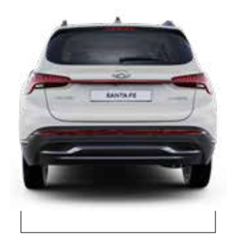
1,900 mm (Excluding Door Mirrors)