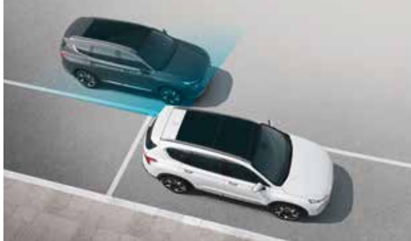
Reverse Parking Collision - Avoidance Assist (PCA): Using the rear camera and ultrasonic sensors whilst reversing at low speeds, a warning is issued on detecting the possibility of a collision with a pedestrian or obstacle. If necessary, brakes are applied.

The SANTA FE protects its passengers from risks all round. With 360° awareness of traffic, pedestrians, and road conditions, the SANTA FE feeds multiple streams of information to the driver with audible alarms and kinetic adjustments where necessary. Taking care of your safety, vigilant systems allow you to focus on the road ahead as the space around you is monitored. Forward Collision Avoidance Assist, protect you from hazards in front and rear-facing sensors alert you to pedestrians or objects behind. SANTA FE comes with technology to make every journey