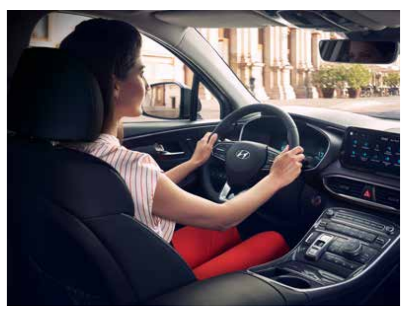
SANTA FE Ultimate. Car shown not to UK Specification.

The SANTA FE delivers efficiency and flair with lower emissions, Hybrid powertrains, adaptive terrain suspension and automatic transmission throughout the range.