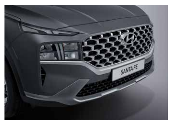
Car shown: SANTA FE Premium.

Fine lines and daring design give the SANTA FE a bold and distinctive presence on the road.