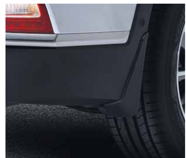
Rear Mud Guards