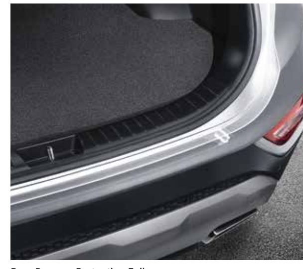
Rear Bumper Protection Foil