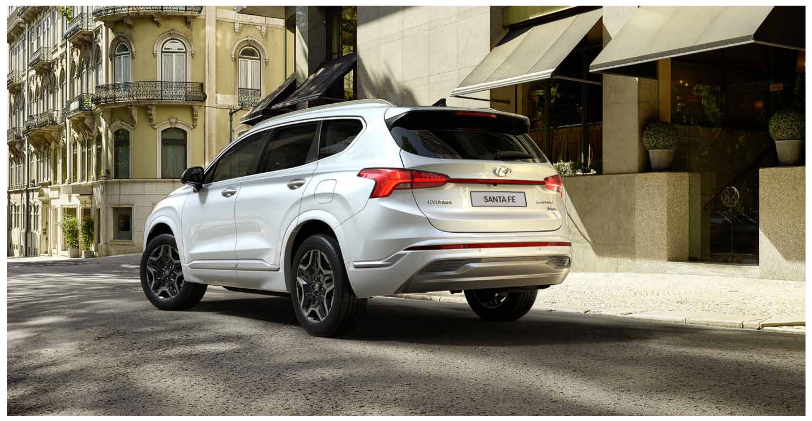
Car shown: SANTA FE Plug-in Hybrid Ultimate with Luxury Pack in Creamy White Pearl.

The commanding front of the SANTA FE features an imposing grille and sculpted bumper for a muscular stance. There are T-shaped light clusters for all-round visibility and increased light-throw. Alloy wheels enhance proportion and poise, and the rear bumper completes the look with high visibility T-form rear lights.