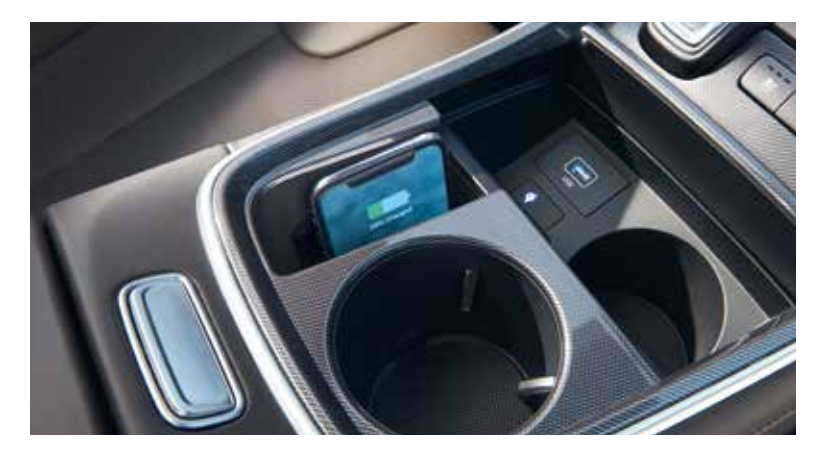
Wireless phone charging pad standard across all trim levels.

Take charge of a bigger world with personalised control.