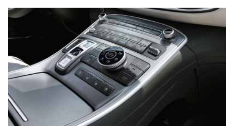
Floating high console with shift-by-wire transmission standard across all trim levels. Aluminum finish standard with Luxury pack.