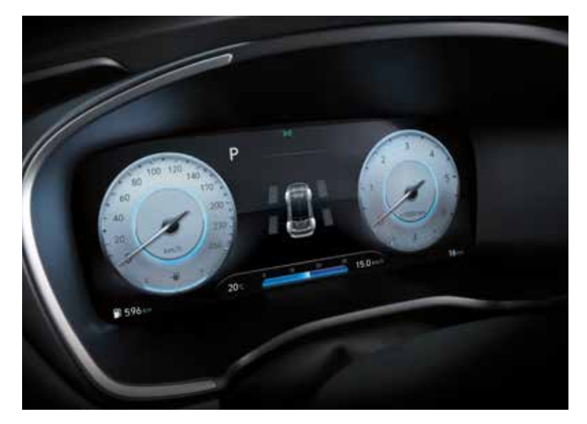
Full 12.3" TFT cluster standard on Ultimate trim.

High specification driver controls and information systems in a spacious interior.