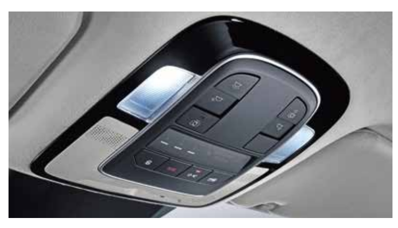
eCall standard across all trim levels.

KRELL premium audio standard across all trim levels.