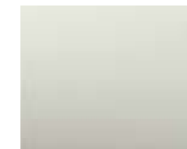
Platinum White Pearllescent