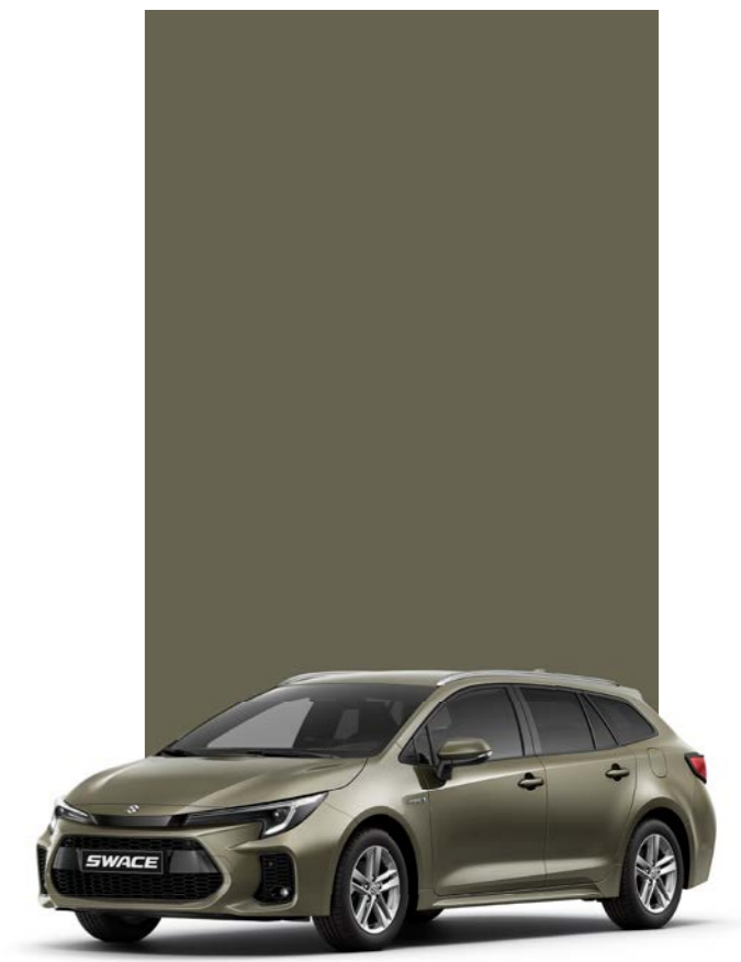
Oxide Bronze Metallic