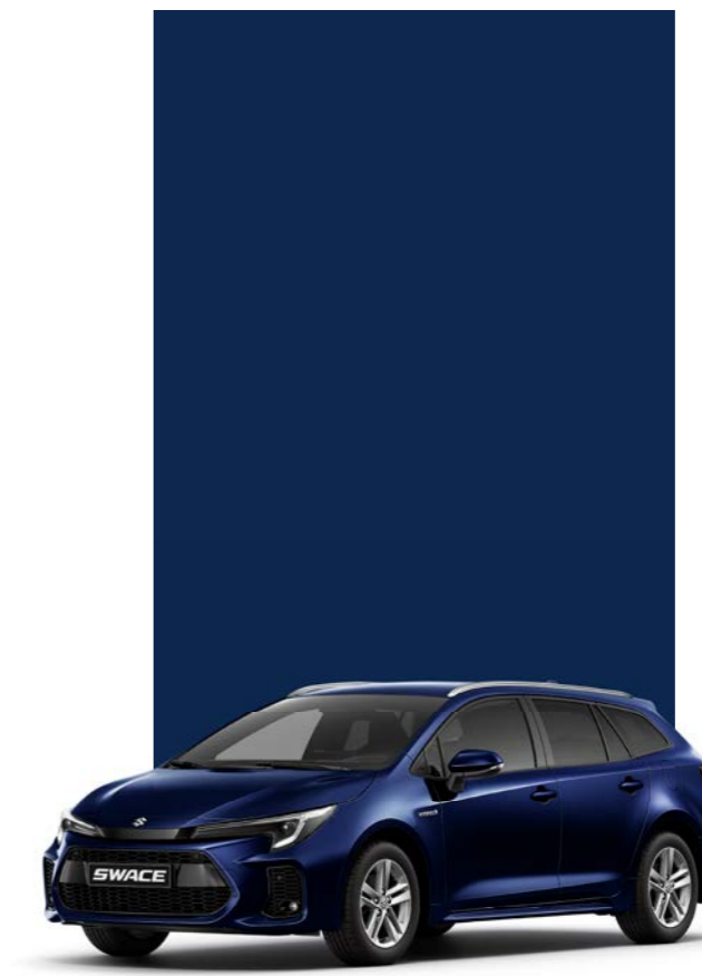
Dark Blue Mica