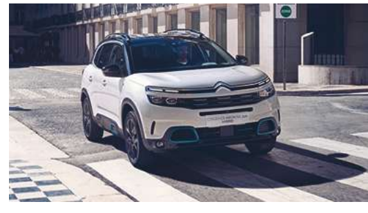
A special feature of the hybrid version is a multi-arm rear suspension which guarantees balance and stability, regardless of the exterior