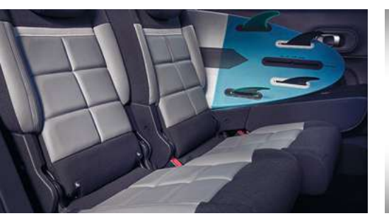
Sliding, reclining and folding, the three individual seats in the rear let you adapt the interior space and boot volume to suit your needs, varying from 460 to 600 litres.

* LED headlights shown are not available on UK models.