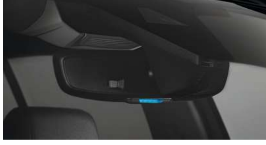
In ZEV mode, a clearly visible blue LED indicator lamp comes on which identifies the vehicle as running in 100% electric mode to other road users.