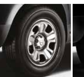
16" 'Matterhorn' steel wheels