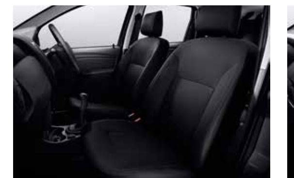
'Bainite' cloth upholstery