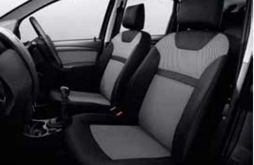
'Graphite' cloth upholstery

*For compatible devices, please refer to https://www.dacia.ie/vehicles/multimedia.html