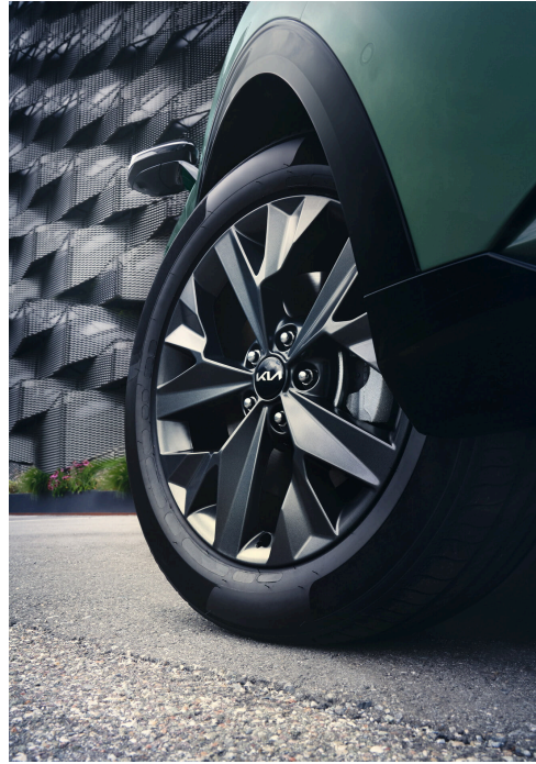
18" alloy wheel