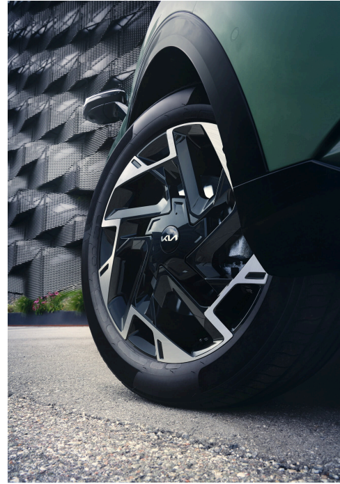
19" alloy wheel