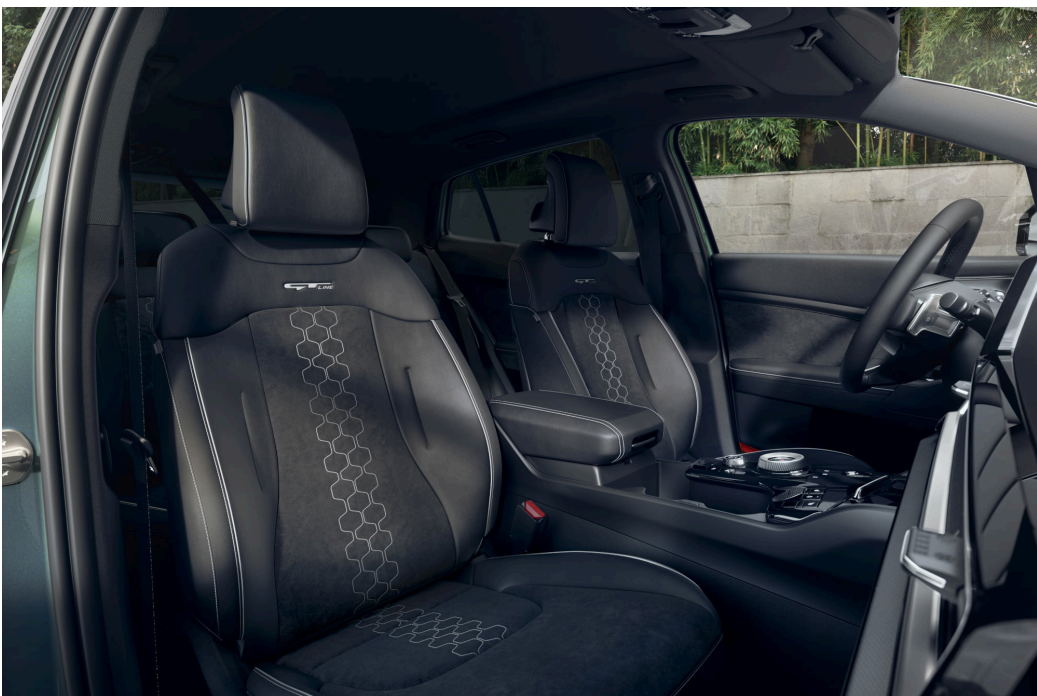
Suede leather with Quilt Design.

(Images are for illustrative purposes only and not up to the UK specification. Features not necessarily standard across the range).