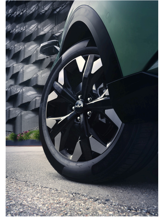
19" alloy wheel