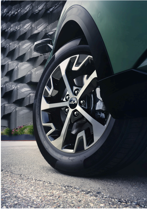
18" alloy wheel