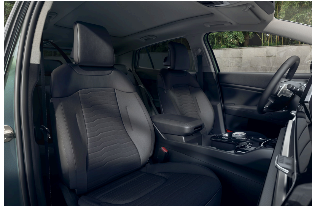
Black cloth and faux leather.