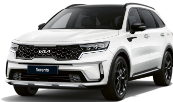
White Pearl (Premium)