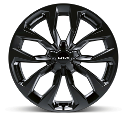
20" Alloy Wheel (Diesel only)