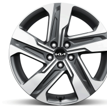
19" Alloy Wheel