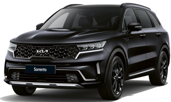
Midnight Black (Premium)

The Sorento Edition is available as Diesel, Hybrid and Plug-In Hybrid.