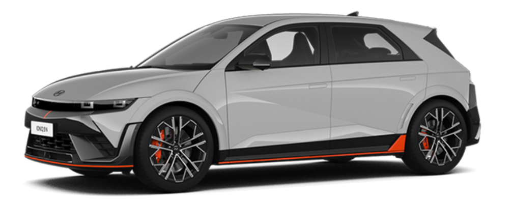
Cyber Grey Metallic