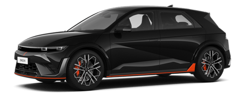
Abyss Black Pearl