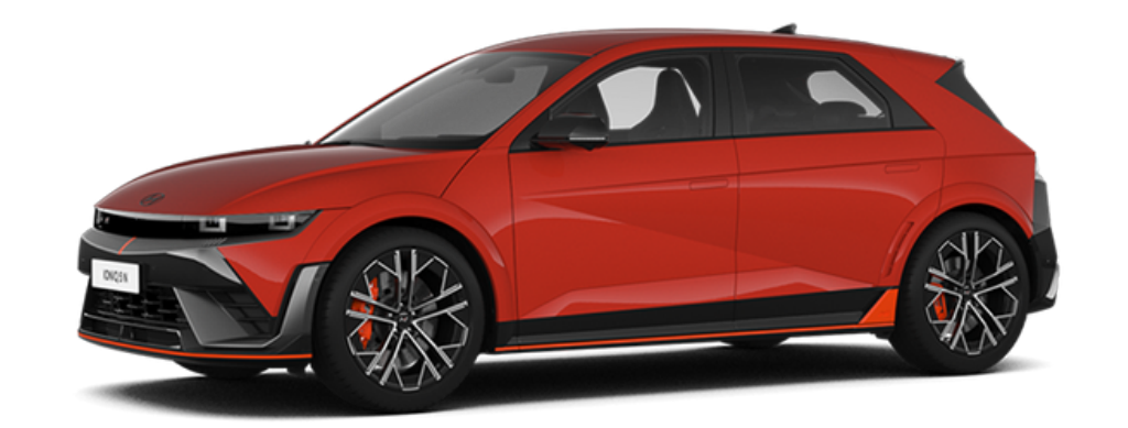
Soultronic Orange Pearl

Choose from a wide range of exterior colours to complement the eye-catching silhouette.