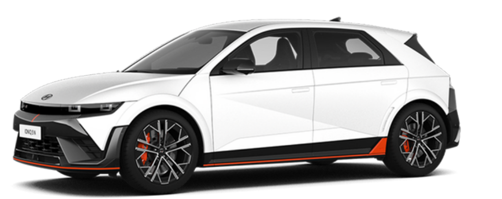
Atlas White Matte