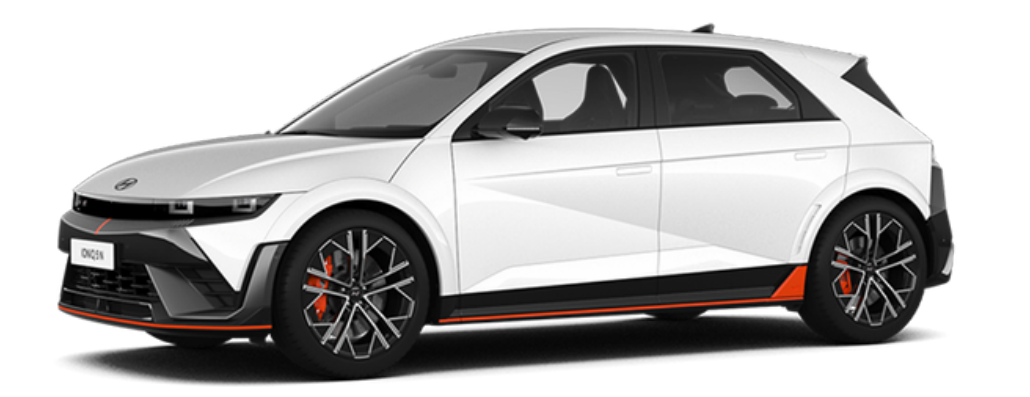
Atlas White Gloss