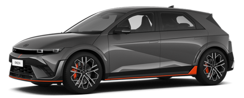
Ecotronic Grey Pearl