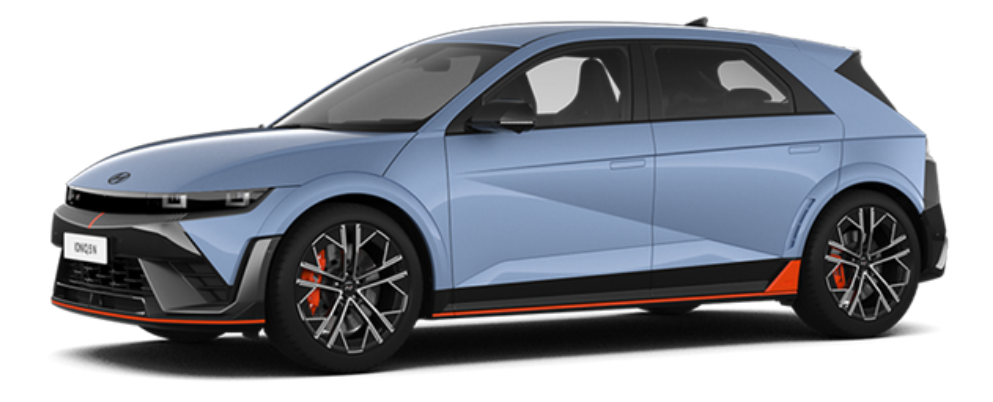
Performance Blue Gloss