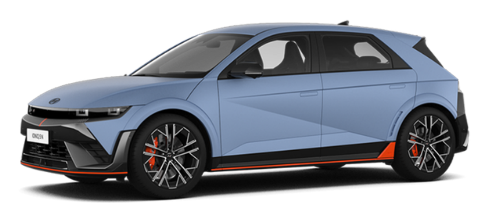
Performance Blue Matte