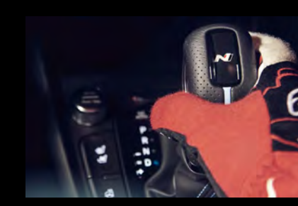
Page 6. N Performance