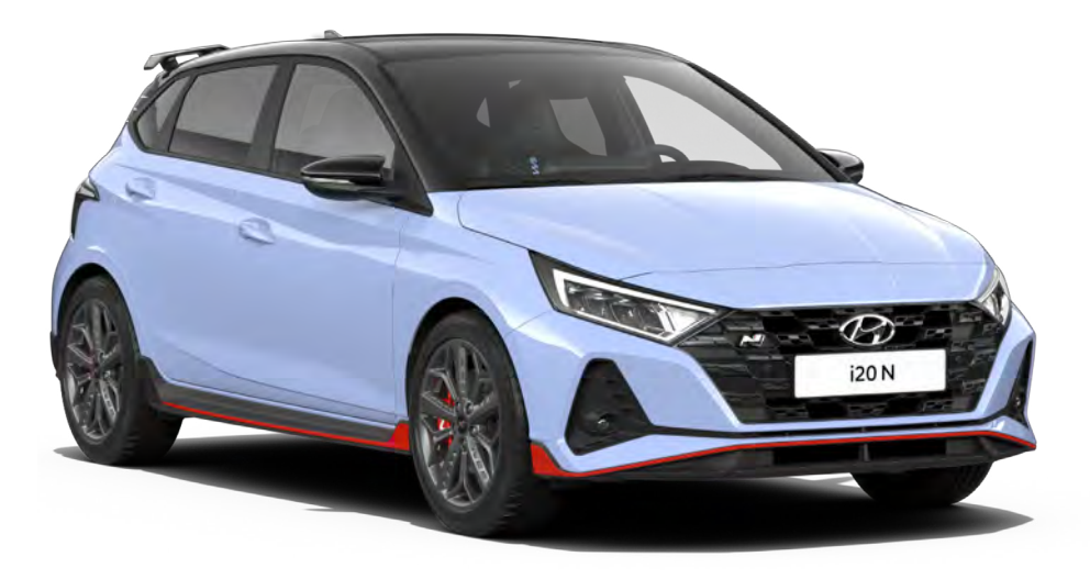
Performance Blue Solid* with optional Phantom Black Pearl two-tone roof.