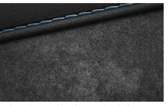
Leather & Alcantara® with Performance Blue stitching. On front seats only.