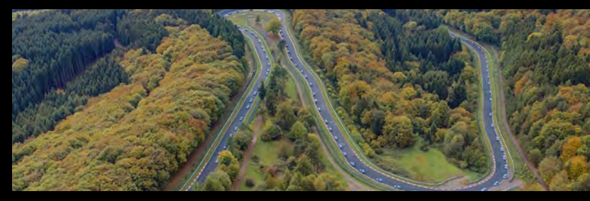
Page 5. From racetrack to road