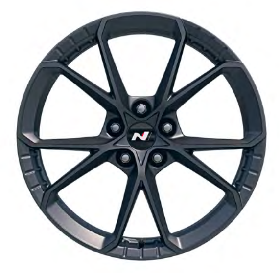
Hyundai's first-ever 19" forged alloy wheels improve handling and traction through a reduction in unsprung weight. They are paired with highperformance Pirelli P-Zero tyres.