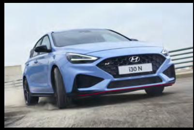
Page 17. i30 N