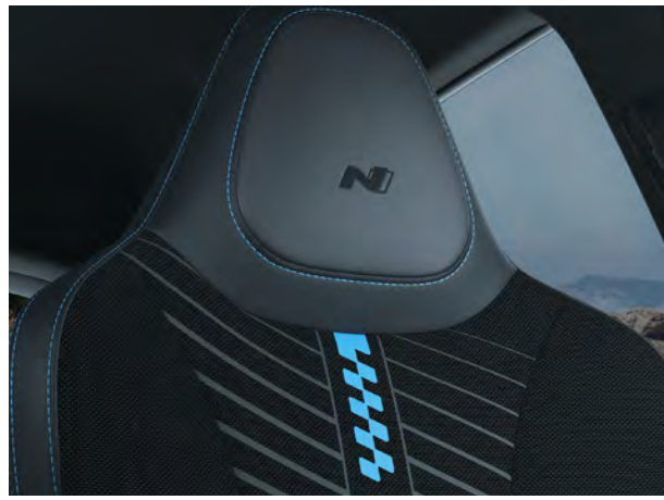
Exclusive Sports leather and cloth motorsport inspired seats with Performance Blue contrast stitching.