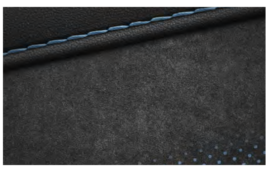
Artificial suede and leather with Performance Blue stitching.