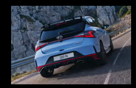
Page 11. i20 N