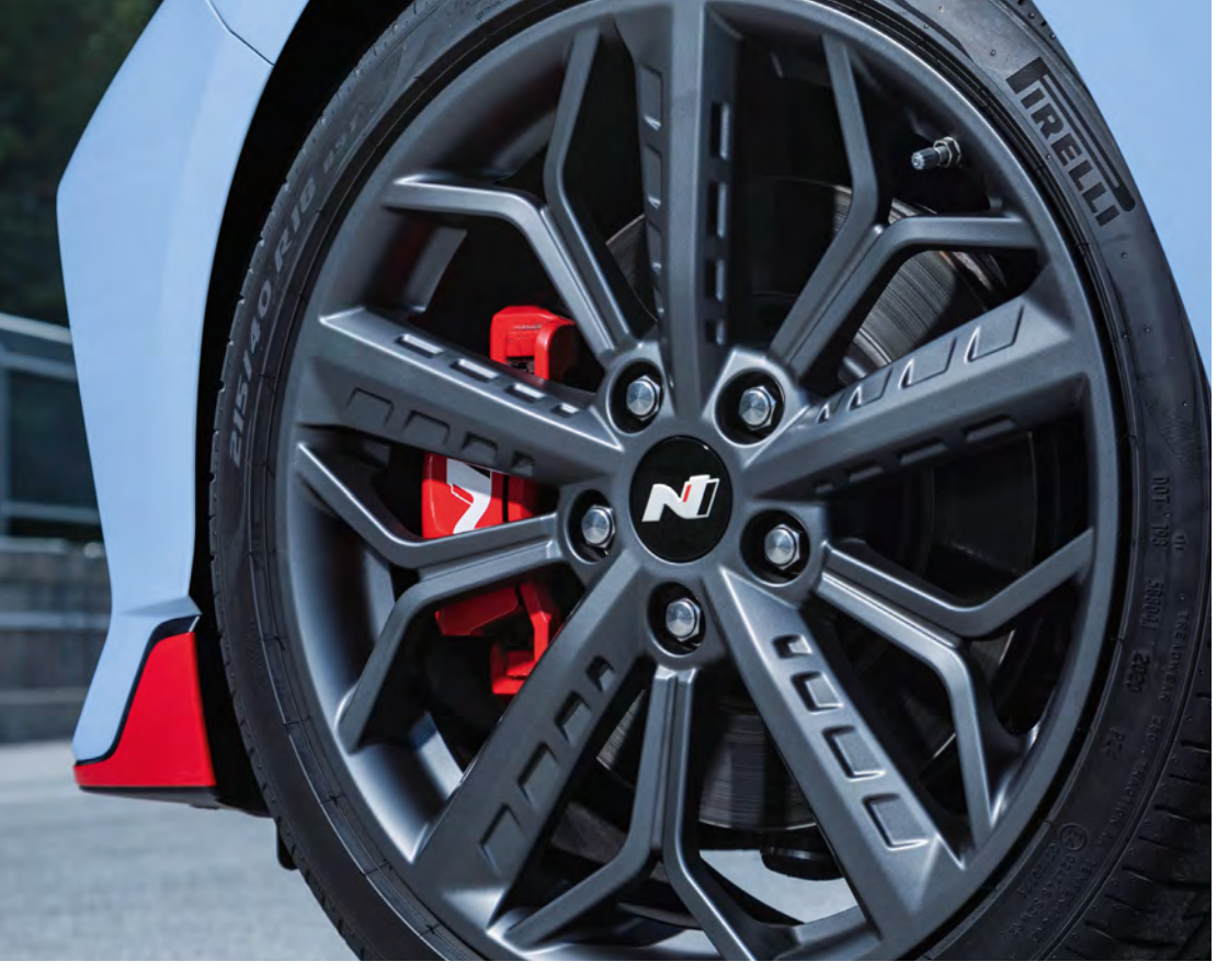
Bespoke 18" alloy wheels with a grey matte finish and N-branded brake callipers.