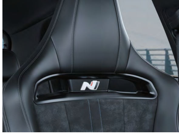
N Light Seats are an additional cost option.